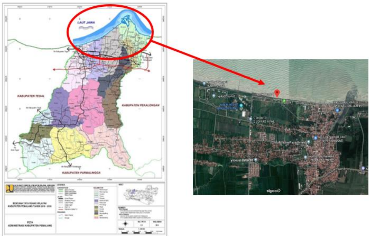
Figure 2. Map of Pemalang Regency and Widuri Beach