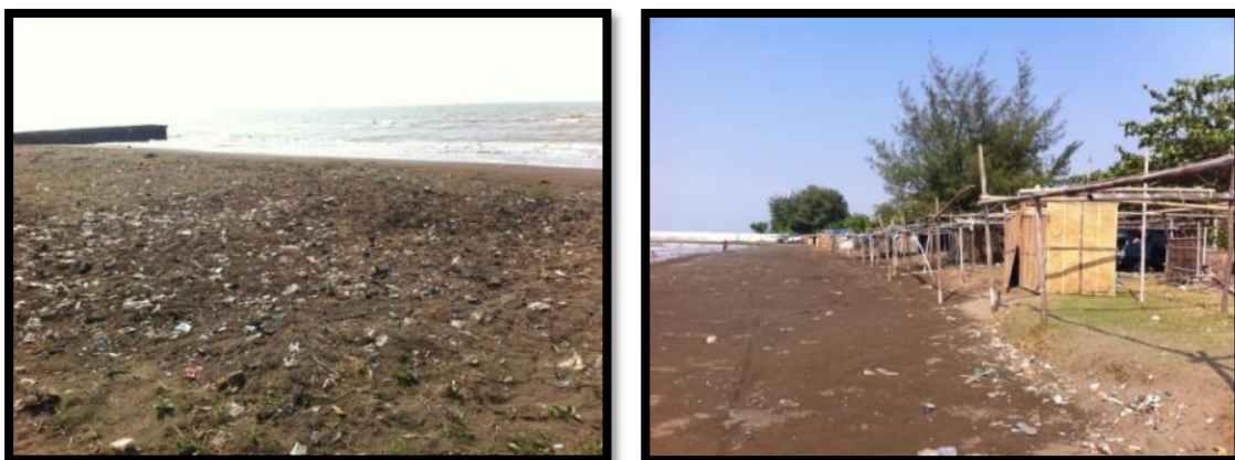
Figure 4. Piles of Trash on the Edge of the Thistle Beach

However, as the most favored tourist attraction in Pemalang Regency, the condition of the Widuri Beach area, presently, does not look well organized (see figure 4). The stall that sells a wide variety of food and drink, are lined up along the coastline and the conditions looked dirty. This condition is aggravated by the act of littering that pollutes the coastal area. The sand of the beach has been mixed with garbage, reducing the beauty of the area. The tourist arena seemed not to be taken care of because along the coastline the garbage was scattered. The color of the sea water was not as clear as a few years ago. Some locations are very dirty. This beach has a cliché problem that is usually faced by other beaches in Indonesia. Trash becomes a destroyer of scenery. Especially in peak time such as holiday which the most crowded visitors.