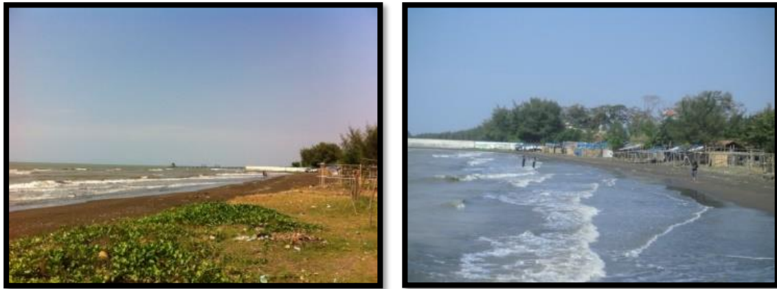
Figure 3. Widuri Beach Pemalang