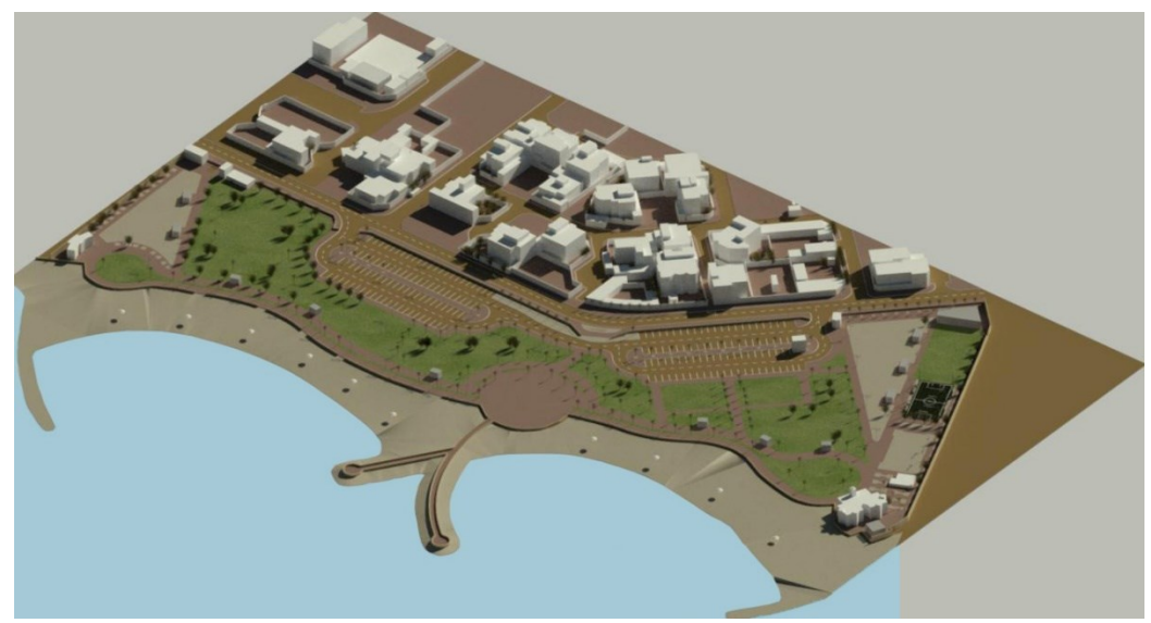
Figure 1. Visualization of a public park (Developed by Author).

Trisyanti et al. (2019) also noted that vegetation modeling is essential for several fields, particularly landscape architecture, where it can be used to visualize and evaluate tools like urban greening, energy conservation, and flood prevention simulations. Moreover, Trisyanti et al. stated that vegetation models are visualized at different levels of detail (LoD), as shown in Table 1, which can be broken down into (i) LoD 1, which only provides information on appearance because it has only two polygons with texture, and (ii) LoD 2, which provides information on appearance and geometry. Additionally, on LoD 1, the form of a 3D model follows the geometry of an object, but in a simplified form; (iii) LoD 3 consists of the 3D model of the tree that already contains semantic information, such as root, trunk, and crown. The semantic information adheres to the tree's hierarchy level, and (iv) LoD 4. It is the highest level and provides all the information aspects of a 3D model. There are three types of appearance: geometry, semantics, and topology. The topological aspect of the model involves the relationship between each part of the tree.