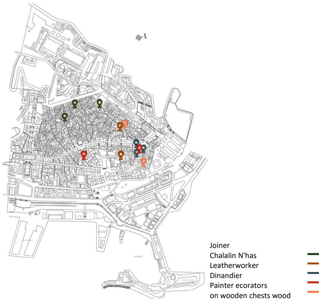
Figure 4. Distribution of craft activities and know-how.