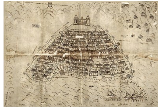
Figure 2.. Drawing of the medina of Algiers by a Spanish captive in 1563 Source:-Sakina Missoum Page 23)