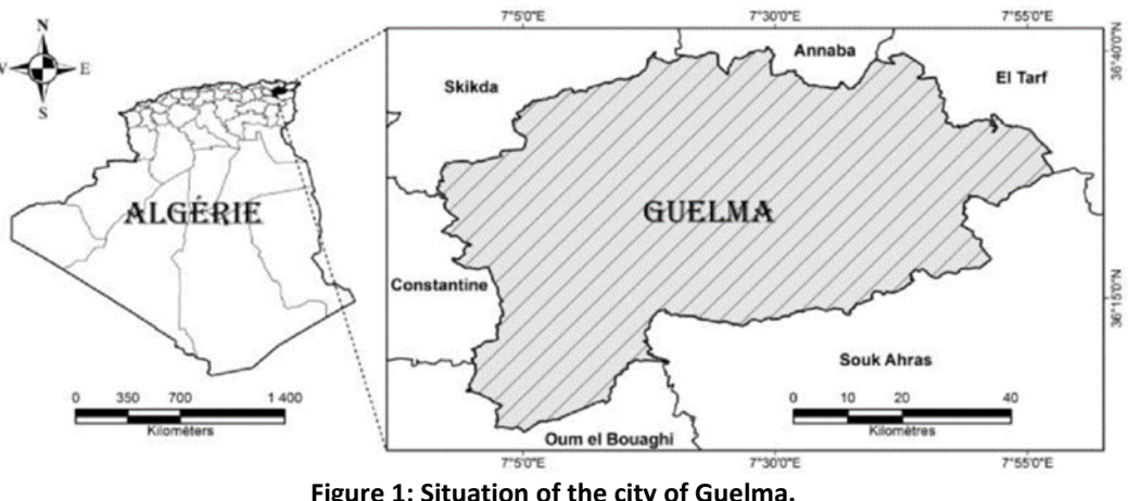
Figure 1: Situation of the city of Guelma.

The city of Guelma is located in the north-east of the country (Algeria) and constitutes, from a geographical point of view, a meeting point, even a crossroads between the industrial poles of the north (Annaba and Skikda) and the trade centres in the south (Oum El Bouaghi and Tébessa). It occupies a middle position between the north of the country, the highlands and the south. The wilaya of Guelma covers an area of 3,686.84 km.