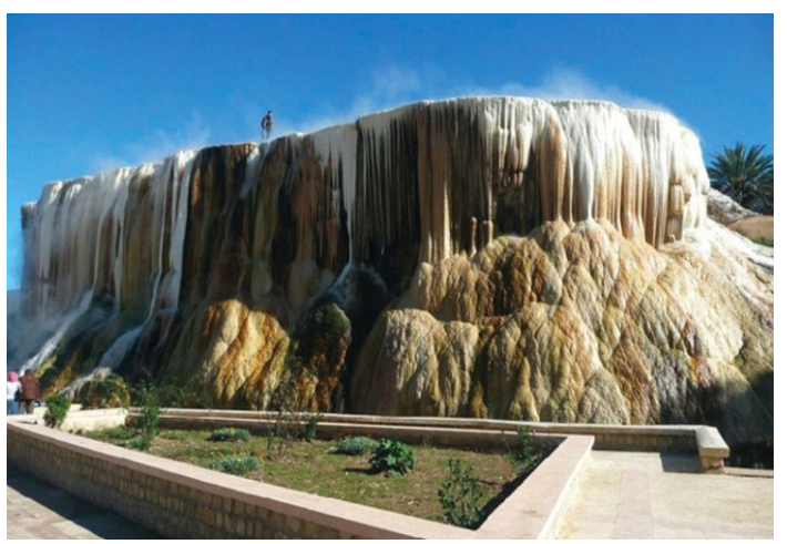
Figure 4: The Hammam Debagh waterfall.

the water. If it is of a dazzling whiteness, where water flows in abundance, affecting the most varied colours, in dry places or with little current, its calcareous incrustations are coloured in various shades, including reddish yellows resulting from the presence of microscopic fungi.