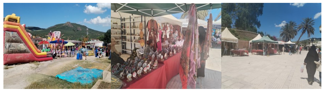
Figure 9: represents the leisure area at the Debagh hammam.