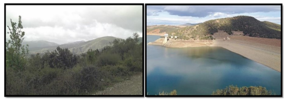
Figure 6: Represents the Hammam Debagh forest and the Buhamdene dam.