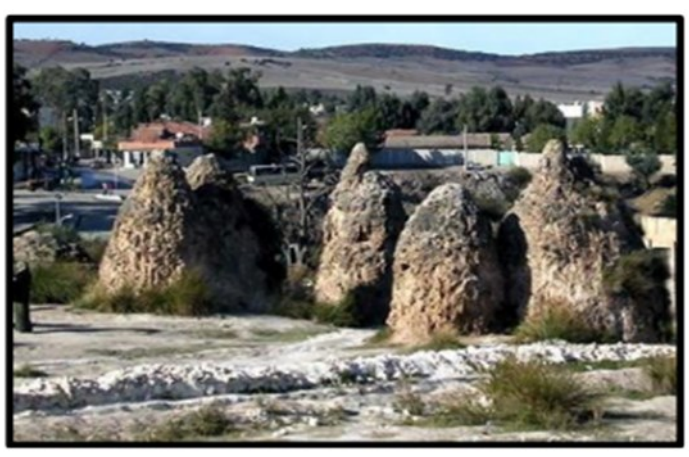
Figure 5: the dolmens.

There are other extraordinary sights in the northern part. This attraction occupies one of these astounding places by the silence and solitude that reigns there. The dolmens, Neolithic tombs, formed of massive rough stone tables, are grouped on a rocky plateau on the edge of a cliff. Also known as crateriformes, they were formed at the time when water gushed out in sprays above the ground, many centuries ago. Some are four or five meters high and are fairly regular.