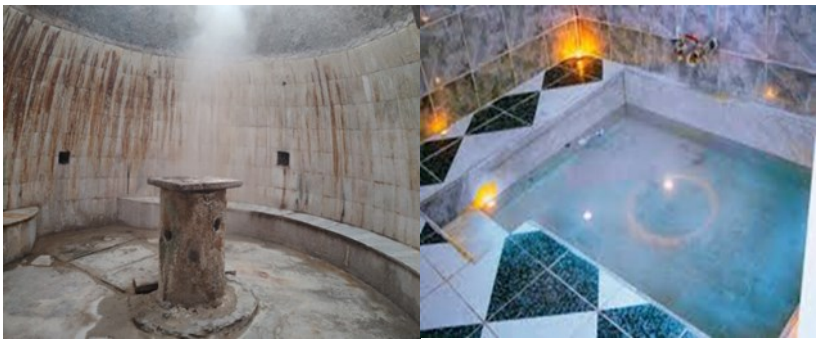
Figure 8: Represents the natural sauna chamber and the hammam pool.