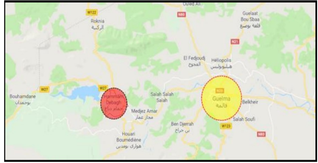
Figure 2: The situation of the municipality of Hammam Debagh in relation to the city of Guelma.