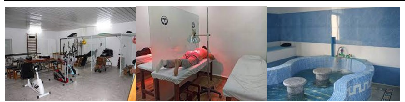
Figure 7: thermal and wellness treatment centres.

7th International Conference of Contemporary Affairs in Architecture and Urbanism (ICCAUA-2024) 23-24 May 2024