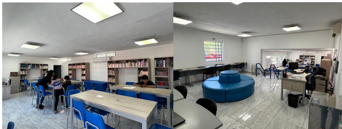
Images 1-6. Public library Lomas de Tampiquito, San Pedro Garza García.