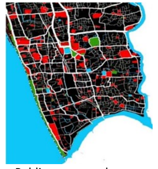
Figure 2. Urban Public spaces and open spaces in Calicut

Four separate TUPS typologies were chosen for this study: the Big Bazaar (Valiyangadi), the Commercial Street (SM Street), the Residential Neighbourhood (Kuttichira), and the Temple Precinct (Tali Temple) (Figure 3). With the help of this Questionnaire, 424 samples were collected, and 90 percent of people believe that tangible elements in traditional urban public spaces contribute to cultural significance. Attributes such as connectivity with the surroundings, the presence of natural elements, the quality of built environments, and so on are regarded as elements of people-place connectedness in these areas.