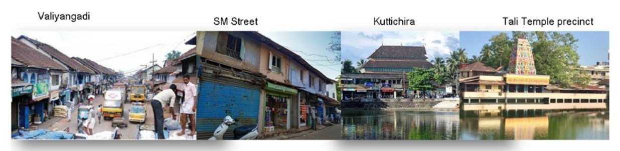
Figure 3. TUPS in Calicut: a) Valiyangadi