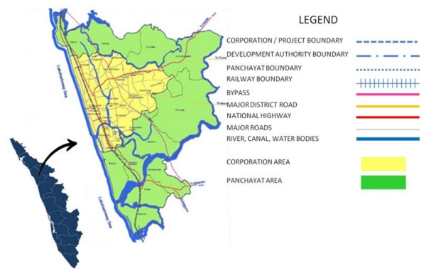
Figure 1. Urban extent

by the Samoothiris (Zamorins). Indicus Analytics, an economic research group, rated Calicut second in terms of investments, houses, and income.