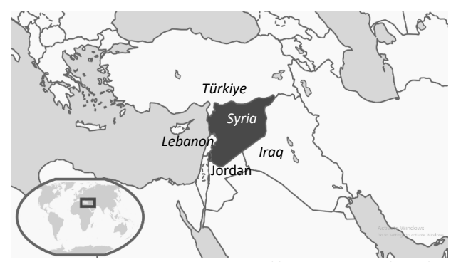
Figure 1. Syria map