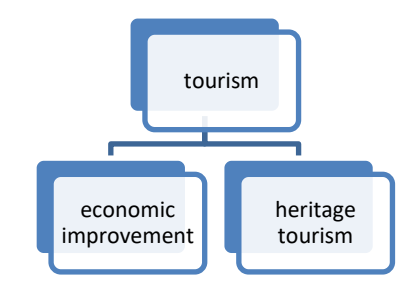
Figure 2. Tourism dimensions – Source by researcher

As observed in chapter of ICOMOS ( The international council on monuments and sites ): it means many things to many people and herein lies its strength and its weakness " ( US ICOMOS 1996 ), The united nations world tourism organization defines tourism as: " the movement of persons to cultural attractions in cities in countries other than their normal place of residence, with the intention to gather new information and experiences to satisfy their cultural needs, and all movements of persons to specific cultural attractions, such as heritage sites, artistic and cultural manifestations arts. It has considered culture as a key asset in tourism development by promoting both tangible and intangible, For Mac Cannell (1993) " All Tourism is a cultural experience ", so tourism is a comprehensive concept and perhaps the specialized concept of culture-based tourism. Therefore, the research adopts tourism with its special concept related to humans and the experience of the place. As a concept of tourism, it is classified into the following types Figure 2: