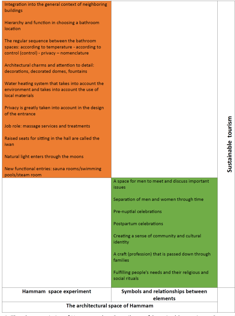
Figure 4. The characteristics of Hammam that Contribute of Sustainable tourism

The table below will summarize the material and intangible components of the bathroom and their achievement for the purposes of sustainable tourism (cultural dimension - economic dimension).