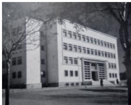
Figure 3. Setif finance Hotel (Architect Louis Regeste)

For this zone, we have found only one example in Setif. The building is characterized by a reinforced concrete frame, a subsoil in masonry rough limestone rubble, double hollow brick walls for the elevation of the walls of the ground floor on the 3rd floor, roof terrace; prefabricated floors, translucent concrete dome of parabolic profile-piles reinforced "rubbed" system with sills and reinforced concrete chaining.