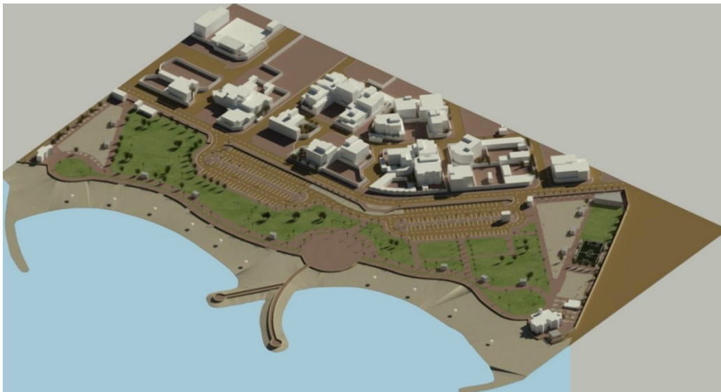
Figure 1. Visualization of a public park (Developed by Author).

Trisyanti et al. (2019) also noted that vegetation modeling is essential for several fields, particularly landscape architecture, where it can be used to visualize and evaluate tools like urban greening, energy conservation, and flood prevention simulations. Moreover, Trisyanti et al. stated that vegetation models are visualized at different levels of detail (LoD), as shown in Table 1, which can be broken down into (i) LoD 1, which only provides information on appearance because it has only two polygons with texture, and (ii) LoD 2, which provides information on appearance and geometry. Additionally, on LoD 1, the form of a 3D model follows the geometry of an object, but in a simplified form; (iii) LoD 3 consists of the 3D model of the tree that already contains semantic information, such as root, trunk, and crown. The semantic information adheres to the tree's hierarchy level, and (iv) LoD 4. It is the highest level and provides all the information aspects of a 3D model. There are three types of appearance: geometry, semantics, and topology. The topological aspect of the model involves the relationship between each part of the tree.