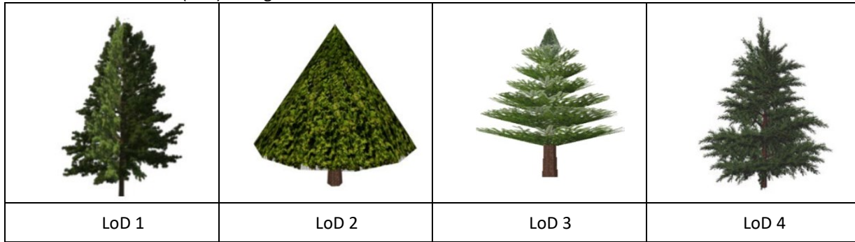
Table 1. Level of Detail (LoD) of vegetation

Moreover, Building Information Modeling (BIM) within the context of Revit software possesses extensive sun and shade settings (Figure 2), enabling the adaptation of these settings within the project following the requirements. The natural lighting settings allow the analysis to be carried out for a precisely defined location using geographical coordinates and the sun's position. According to Borkowski and Luczkiewicz (2023), the findings can aid in strategic planning and managing space within the landscape design. Furthermore, Figure 3 shows the results of sun and shade setting hourly and its implications for shading analysis of through landscape components.