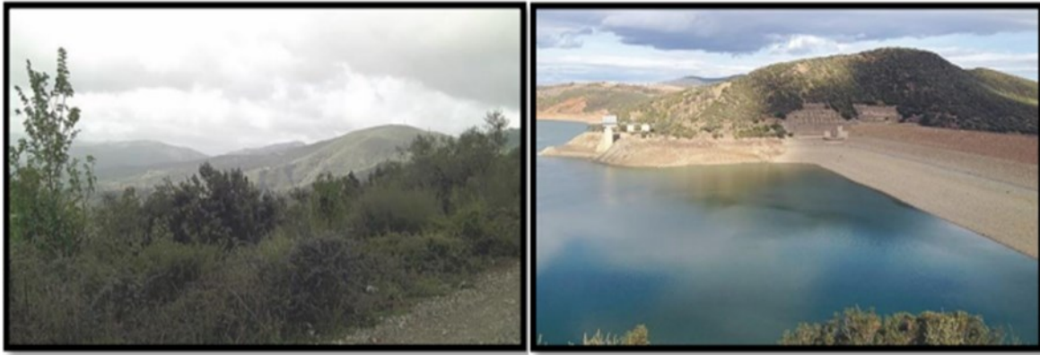
Figure 6: Represents the Hammam Debagh forest and the Buhamdene dam.