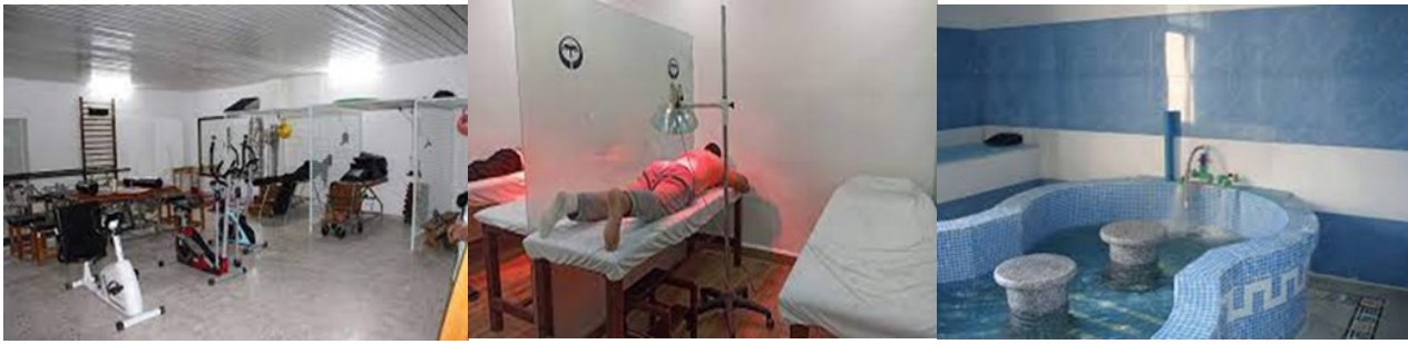
Figure 7: thermal and wellness treatment centres.