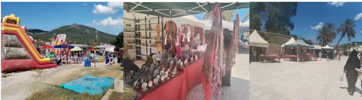
Figure 9: represents the leisure area at the Debagh hammam.