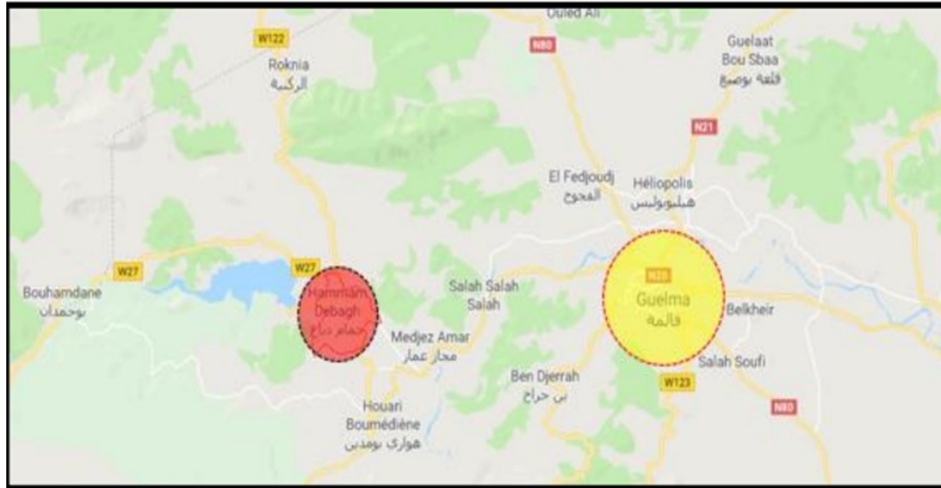
Figure 2: The situation of the municipality of Hammam Debagh in relation to the city of Guelma.