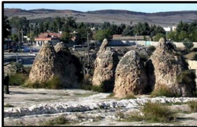
Figure 5: the dolmens.

There are other extraordinary sights in the northern part. This attraction occupies one of these astounding places by the silence and solitude that reigns there. The dolmens, Neolithic tombs, formed of massive rough stone tables, are grouped on a rocky plateau on the edge of a cliff. Also known as crateriformes, they were formed at the time when water gushed out in sprays above the ground, many centuries ago. Some are four or five meters high and are fairly regular.