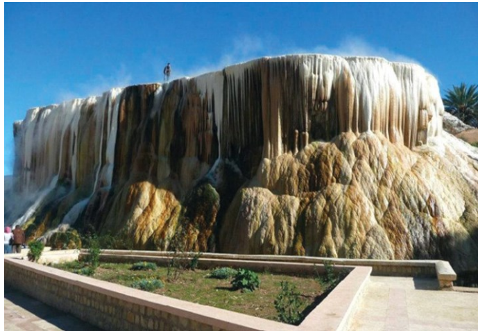
Figure 4: The Hammam Debagh waterfall.

the water. If it is of a dazzling whiteness, where water flows in abundance, affecting the most varied colours, in dry places or with little current, its calcareous incrustations are coloured in various shades, including reddish yellows resulting from the presence of microscopic fungi.