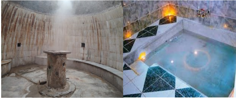
Figure 8: Represents the natural sauna chamber and the hammam pool.