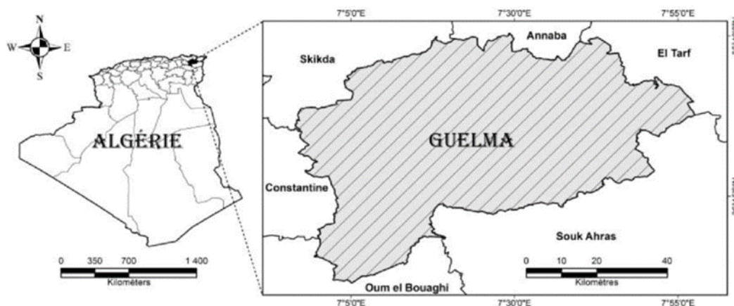
Figure 1: Situation of the city of Guelma.

The city of Guelma is located in the north-east of the country (Algeria) and constitutes, from a geographical point of view, a meeting point, even a crossroads between the industrial poles of the north (Annaba and Skikda) and the trade centres in the south (Oum El Bouaghi and Tébessa). It occupies a middle position between the north of the country, the highlands and the south. The wilaya of Guelma covers an area of 3,686.84 km.