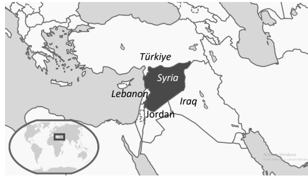
Figure 1. Syria map