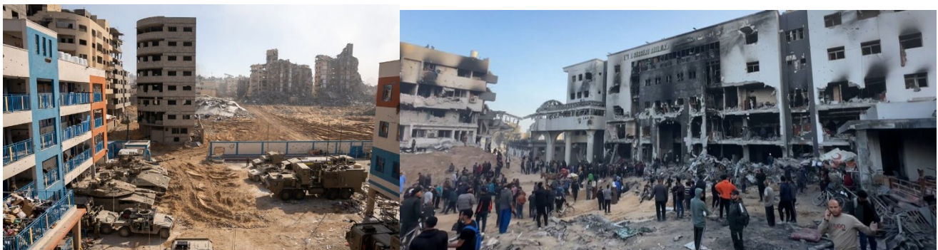
Figure 8. left picture : Presence of the occupation army and military equipment in the schoolyard (EMANUEL FABIAN, 2023) right picture Al- Şifa Hospital was completely destroyed and turned into a pile of rubble after it was bombed for the second time (UN News)

Due to bad conditions, migration and shelter were not limited to tents/camps. Some refugees took shelter in collapsed buildings. From the perspective of displaced people, this is the safest place. Since it is thought to have ceased to be a target because it has been bombed by the occupying Israelis before, it is safe and it is illogical to bomb it again. While this theory brought successful results in many cases, unfortunately it cost the lives of some refugees who continued to live in the north. Many of them took shelter in the destroyed Shifa Hospital, under the pretext that it had previously been the command center of Hamas. After the Israeli army evacuated, destroyed and withdrew in January, many refugees returned to the hospital to protect themselves. Since this place was extensively ransacked and destroyed, there was no need for the Israelis to return there again. Because they achieved their goals for this place, they made sure it was not a military area and they blew up the sections they wanted. Despite this, the Israelis returned on March 17 and bombed the hospital building and its surroundings again, making it unable to accept refugees again. This situation shows the failure of the previously mentioned and unproven theory that "what is destroyed becomes safer". Therefore, there is no safe place left that the Israeli army has entered or has not entered, whether it is civilian or international, whether it has been bombed before or not. (UN News)