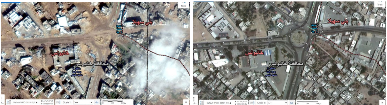
Figure 2. Aerial photos from geomolg show the infrastructure destruction khan- Younis.

2 million people live in the Gaza Strip and 50 percent of the population consists of children. Gaza society is a vibrant, young and dynamic society. The majority of Gaza's population consists of Palestinian refugees who came from Palestinian cities and villages during the Israeli occupation of Palestine and its war against the Arab armies in the 1948 and 1967 wars. All that remains of them today are the traces and names of the abandoned villages they wanted to return to and regain their property there, based on the United Nations resolutions that "give refugees the right to return to the homes and cities from which they were displaced." (Aruri. N, 2001)