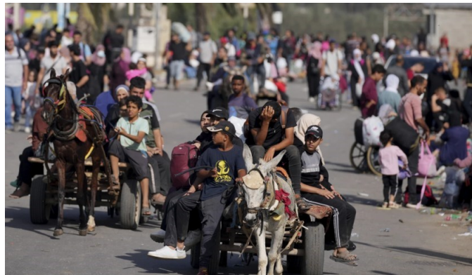
Figure 11. Gazian people using the donkies in transportation (NAJIB JOBAIN, 2023).

In response to the unjust destruction of infrastructure and paved roads in the Gaza Strip, many residents have resorted to primitive methods of transportation. They started using donkeys and horses, which do not need the fuel banned from entering Gaza and can drive on destroyed roads that modern cars cannot travel. (NAJIB JOBAIN, 2023) As a result, the people of Gaza saw a return to the basic elements and basic principles of civilization, whether in terms of movement, nutrition or even shelter, as a safe solution. Thus, it returned to the basic source of civilization, aiming to maintain communication with the remaining members of the urban group to which it was affiliated and of which it was one of the elements.