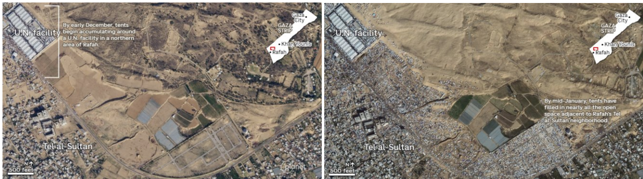
Figure 7. Images of the area where tents were set up in the area adjacent to the United Nations headquarters during a forty-day period from December 03 to January. (Becky Sullivan, Anas B & Abu Bakr B, 2024).

This statement reflects the density of refugees in Rafah, and many problems arose in services due to this density. There is no infrastructure in the region to serve such a large number of refugees. As one refugee noted, "There is no water here and toilets are another source of distress." This refugee also said that "Garbage is also a problem, it is accepted as one of the basics of life, and it is an issue that human beings have realized its importance for survival since the beginning of history and approached it correctly. (Becky Sullivan, Anas B & Abu Bakr B, 2024).