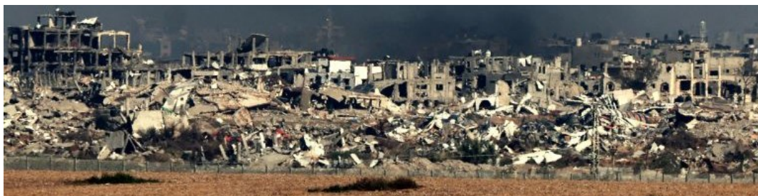
Figure 4. Gaza skyline from the border (Lisa Beyer, 2023).

commanders makes the following statements regarding Israel's aim to destroy the buildings adjacent to the border: "I want everyone living in Ghilaf Gaza settlements to return to their homes and not see the Shucaiye District in front of them when they open the window facing west. That's why we're here." From these statements, the colonial and genocidal background behind the genocidal activities is clearly understood. (Maher Charif,2024) ( Forensic Architecture , 2024)