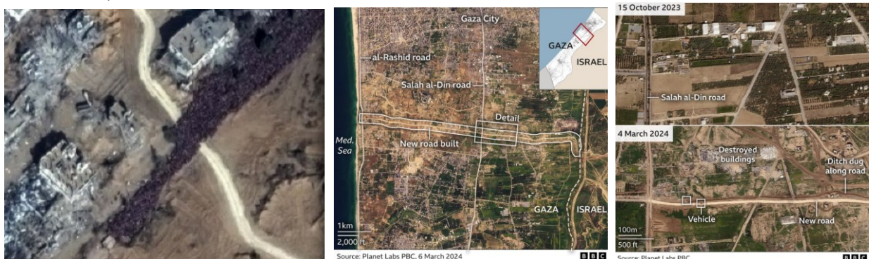
Figure 10. at the Left: Aerial view of the checkpoint on Salah al-Din Street. At the midel and the right show the new road 749 satellite views by BBC (Abdirahim Saeed and others,2024)