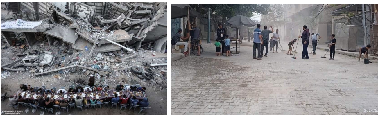
Figure 13. Ramadan Iftar photo by photographer Mahmud Accur on the ruins of the neighborhoods destroyed by the occupation

In addition, the collective life of Gazans continues not only as individuals, but also in groups, starting from the smallest and the largest family, to the children of the family, passing through the neighborhood and the local people, until they belong to the city. As Amin Maalouf describes, all of these loyalties are important and manifest in Gazans' relationships with each other. This situation deepened further during the month of Ramadan, which the people of Gaza had a difficult time with, but they were able to live together as members of a single tribe and group, as can be seen from the collective iftar served on the ruins of the building in the picture below. We see this in the mass iftar dinners, which are one of the most important Ramadan traditions of Gaza and strengthen social relations, emphasizing that everyone is a brother and a family, that there is no difference between rich and poor, on the contrary, they are all the same. We see an example of a similar solidarity in the two pictures below; The picture on the left shows the cooperation of local residents in clearing the Shujaiya neighborhood on the northern side of the Gaza Strip, which was one of the first areas bombed at the beginning of the war, as pointed out by Nur Naim, one of Gaza's influential figures.