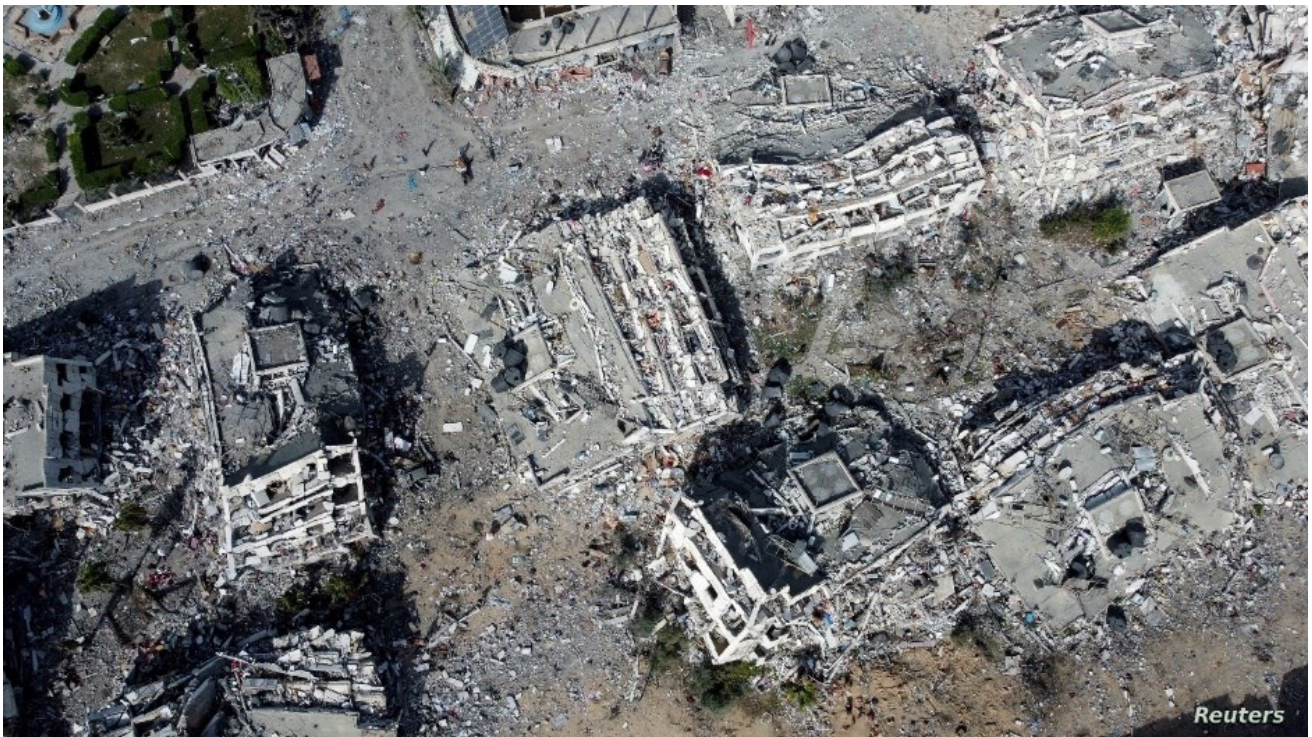
Figure 1. Aerial photos from Reuters: "How the Israeli bombing made Gaza look like the surface of the moon" November 28, 2023.

Keywords: Gaza; Palestine; genocide; Urbicide; city; occupation; war; architecture.