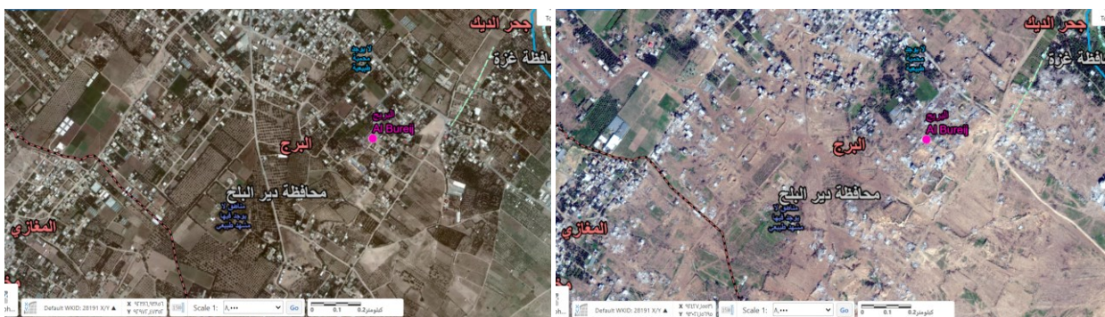
Figure 3. compare between before and after the war and how the agricultural land and homes had been destroyed (Geomolge ,2024).

All of these show the systematic, planned and clear urban massacre taking place in the Gaza Strip. From the direct killing of people to the killing of basic needs that provide stability such as housing, shelter and security; It extends to eliminating livelihoods by destroying drinking water resources, agriculture and all sources of order and stability. (Azzouz, A, 2024) The destruction of agricultural lands, the demolition of factories, the elimination of crops and greenhouses lead to the loss of memory, identity, belonging and group ties among members of society. (Fuad Abu Saif, 2024) With the completion of these goals, we will be a fragmented society that wants to migrate and leave individually rather than collectively, and that has the ability to go anywhere if given the opportunity. Thus, the Zionists' desire to evacuate the population in the Gaza Strip and make more room for Jewish settlers will be realized.