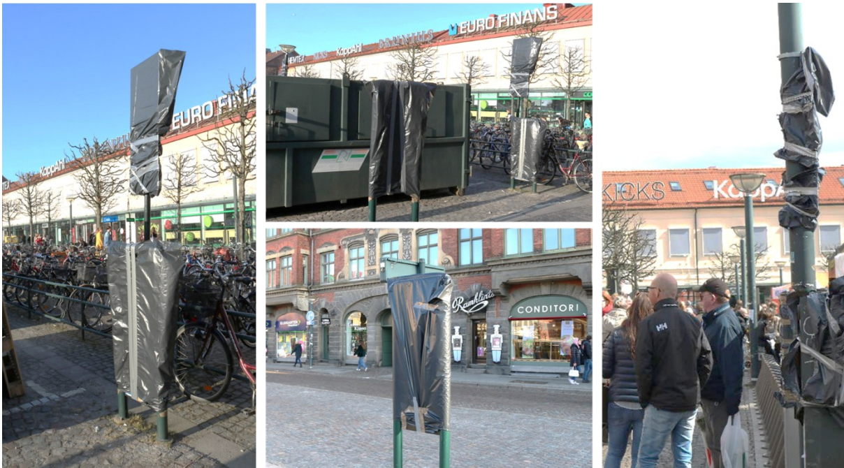
Figure 8. The existing street signage, covered over for the Lund International Food Festival, 2022.

There are then small groups of people (Fig. 9). The straight white line on the ground that denoted the original space's parking bays is clearly one aspect of the urban design that now stands out as a border. Despite being unofficial, this border appears to be recognised and utilised by the guests as they adjust their placements within the square. I noticed a number of instances where people appeared to congregate right next to it. Because pedestrians see and use the white line as a means of defining the crowd's edge, it gives them the ability to control the crowd's shape. Thus, this type of element serves as a "formal group border."