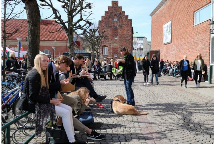
Figure 6. The Lund International Food Festival, 2022.

I was still on the north side of Mårtenstorget in the following image (Fig. 7). The event organisers nailed the red cabinet, which served as a temporary power source, to the tree trunk. It was put in place to provide electricity to the food stalls, but for safety, they covered it with a wooden board, creating an unofficial table that the first group on the left was welcome to stand by and use for their food and beverages. The second group on the right quickly followed this pioneer group, forming a larger group around the tree.