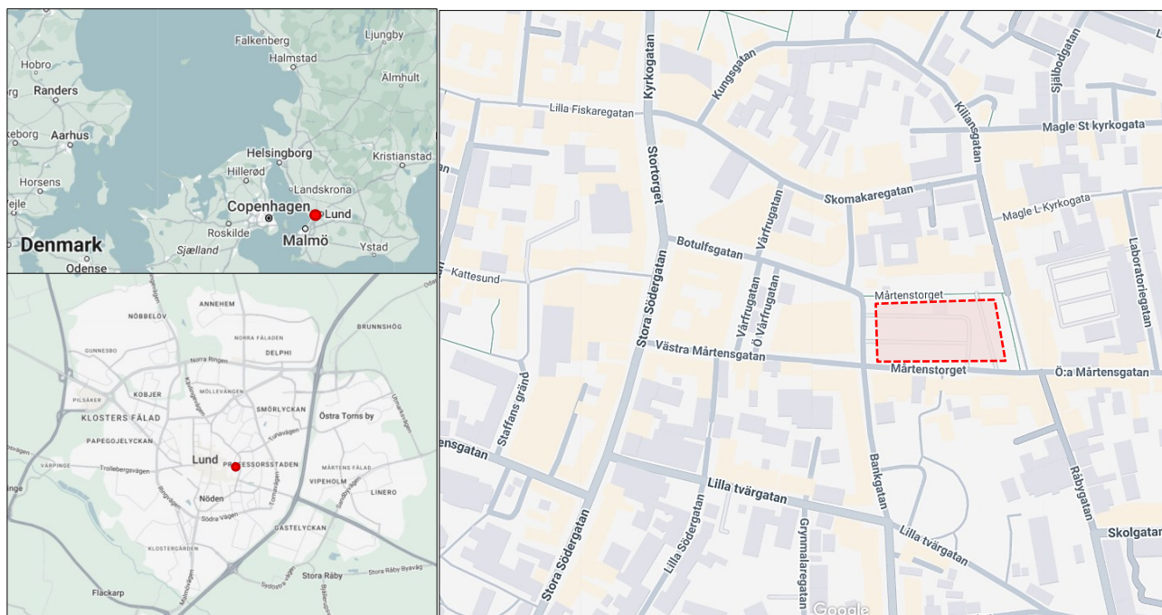
Figure 1. Mårtenstorget, the location of the annual Lund International Food Festival.

This study mainly uses photographic observations to examine the connection between pedestrian interactions with the physical components of urban design. Big efforts are made to document in photographs how urban design materials impact social interaction spaces at any given time at Lund's main public square.