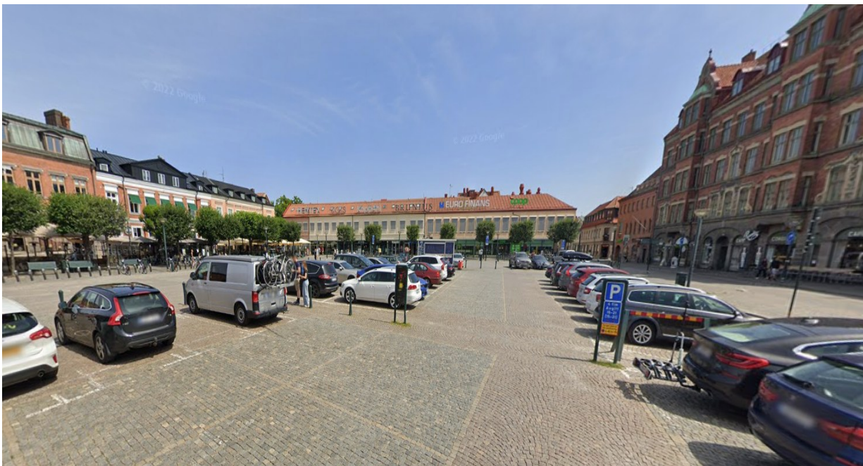
Figure 3. Mårtensstorget square .

Occasionally, there is also a flea market. All of the vendors must depart at 14.00, marking the end of the market. The second rhythm, which begins at 15.00 and lasts until the following morning, when a sizable portion of the square is turned into a parking lot, is the late afternoon and evening rhythm. On the other hand, Mårtensstorget hosts an annual event called the International Food Festival.