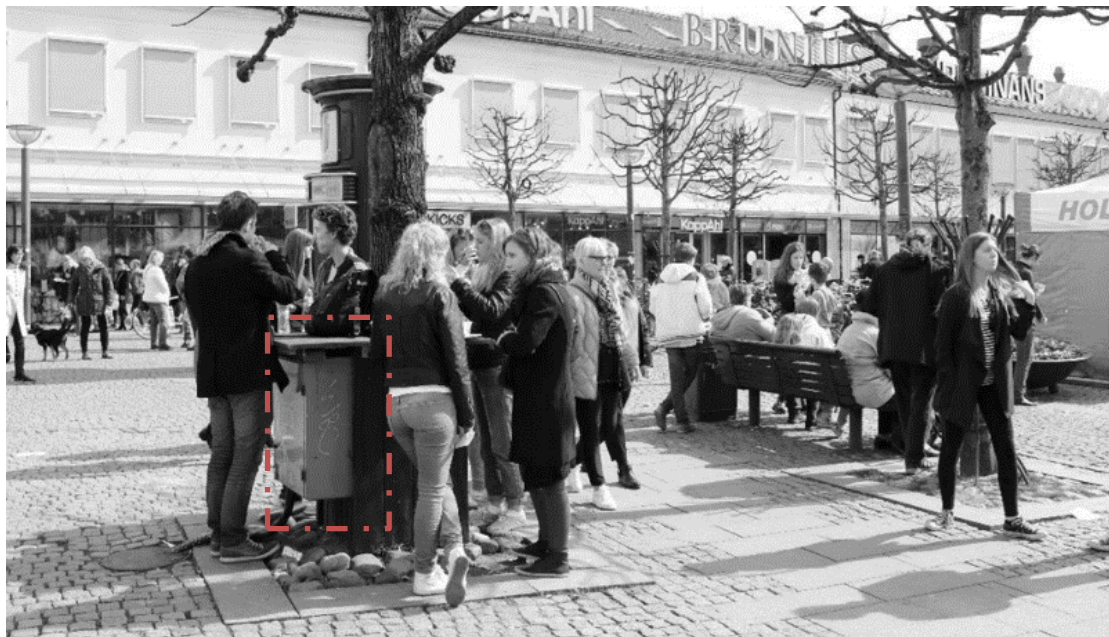
Figure 7. The Lund International Food Festival, 2022.

I was still on the north side of Mårtenstorget in the following image (Fig. 7). The event organisers nailed the red cabinet, which served as a temporary power source, to the tree trunk. It was put in place to provide electricity to the food stalls, but for safety, they covered it with a wooden board, creating an unofficial table that the first group on the left was welcome to stand by and use for their food and beverages. The second group on the right quickly followed this pioneer group, forming a larger group around the tree.