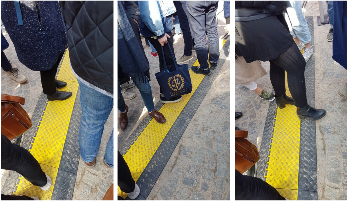
Figure 10. Crowds walking or pausing, affected by urban design elements (cable ramps) at the Lund International Food Festival, 2022.

Part of a row of city rental bicycles in Lund is depicted in the following image (Fig. 11). They are usually affixed to their stands on the square's north side, but for the duration of this event, the majority were taken down to make room for the food stalls. However, a few bicycles were left in their original locations, in their stands, forming a physical barrier that prevented people from moving between the festival's inside and outside. However, the bikes also created a distinct informal grouping border (Alrabadi, S., 2020).