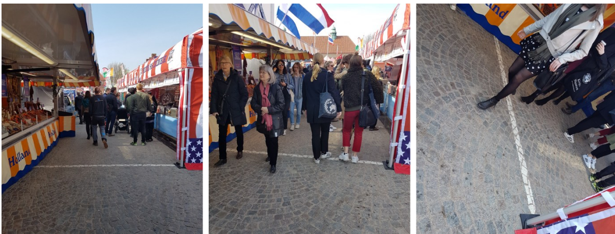
by the author.