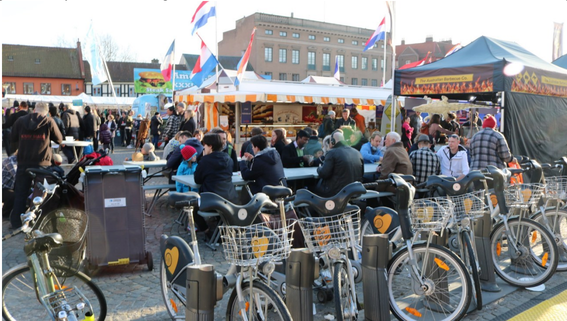
Figure 11. Bicycle racks affecting the crowd's border at the Lund International Food Festival, 2022.

Part of a row of city rental bicycles in Lund is depicted in the following image (Fig. 11). They are usually affixed to their stands on the square's north side, but for the duration of this event, the majority were taken down to make room for the food stalls. However, a few bicycles were left in their original locations, in their stands, forming a physical barrier that prevented people from moving between the festival's inside and outside. However, the bikes also created a distinct informal grouping border (Alrabadi, S., 2020).