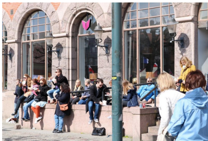
Figure 5. The Lund International Food Festival, 2022.

A number of pictures are taken to document firsthand observations of the Lund food festival. A concrete parapet or base with a railing is utilised as casual seating in the first image (Fig. 5). The image displays the food festival and the entrance to the RoseGarden restaurant on the north side of Mårtenstorget. The entrance ramp faces south and receives full sun. It provided some social interaction by acting as casual seating for attendees of the event. The first person or pioneer to sit on the wall is not identified in the pictures, but it is evident from comparing the first and second that the pioneer's action had a lasting impact on those in the vicinity, encouraging more people to use the wall as a casual seating area and to form nodes around that particular area (Alrabadi, S., 2020). It can be more logical to think of this process of increased interaction as a contagious effect, even though there may have once been a pioneer who somehow persuaded others to see the wall as a place to sit.