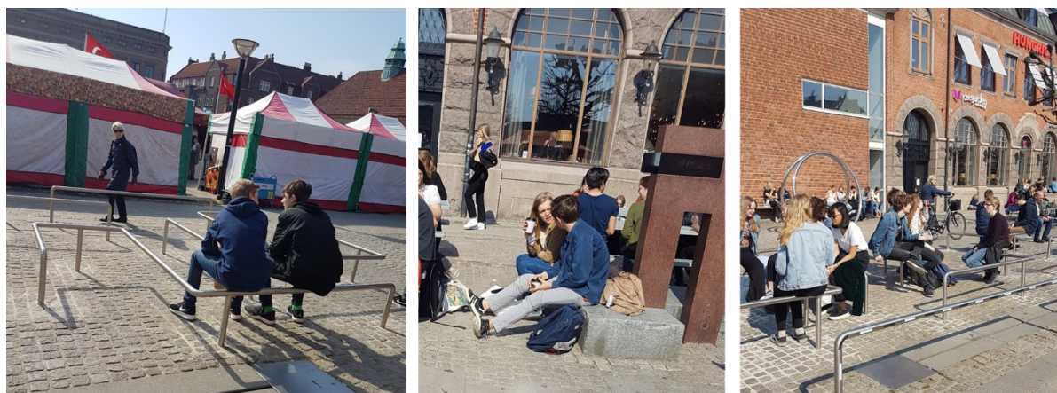
Figure 12. Urban design elements afford informal seating where people can gather and crowd, here at the Lund International Food Festival, 2022.